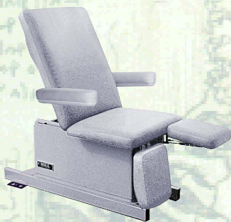
leg sections down

Table has a one-year warranty and is available with a gray or beige base and several attractive upholstery colors.