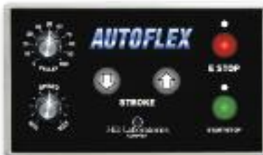
The Auto-Flex Control Panel with Start/Stop, Emergency Stop, Cycle, Speed, and Stroke Depth Controls.

Auto-Flex allows you to treat your patients manually or easily switch to Auto-Flex for Motorized Flexion. Using the Auto-Flex Control Panel, you set the exact speed and the number of treatment cycles. You also have complete control while the table is in motion to change the speed and amount of flexion at any time. The Auto-Flex feature greatly enhances your ability to treat more than one patient at a time and its addition does not sacrifice any of the features found on the manual Air-Flex model.