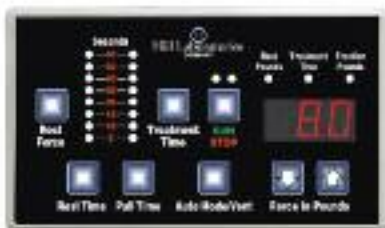
The Control Panel is hinged for easy readability and allows you to set the treatment time, traction poundage, and the rest and pull time.

The Auto-Distraction feature adds programmable automatic decompression traction to the Hill Air-Flex. With ankle straps attached to the patient, you can administer long-axis traction at a specific poundage. The lower end of the table cycles in and out according to the parameters that you enter into the control panel. The patient is secured by a counter traction strap around the waist. During treatment, the table can also be locked in a lateral and/or flexion position. A helpful instructional DVD is included with this feature.