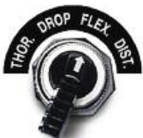
The flow of air-pressure is directed by the Air-Flex Selector Switch

Adjust the air-pressure for flexion or instantly reset the drops by simply tapping the foot pedal, all without removing your hands from the patient!