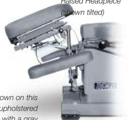
Tables shown on this page are upholstered in gray with a gray table base.