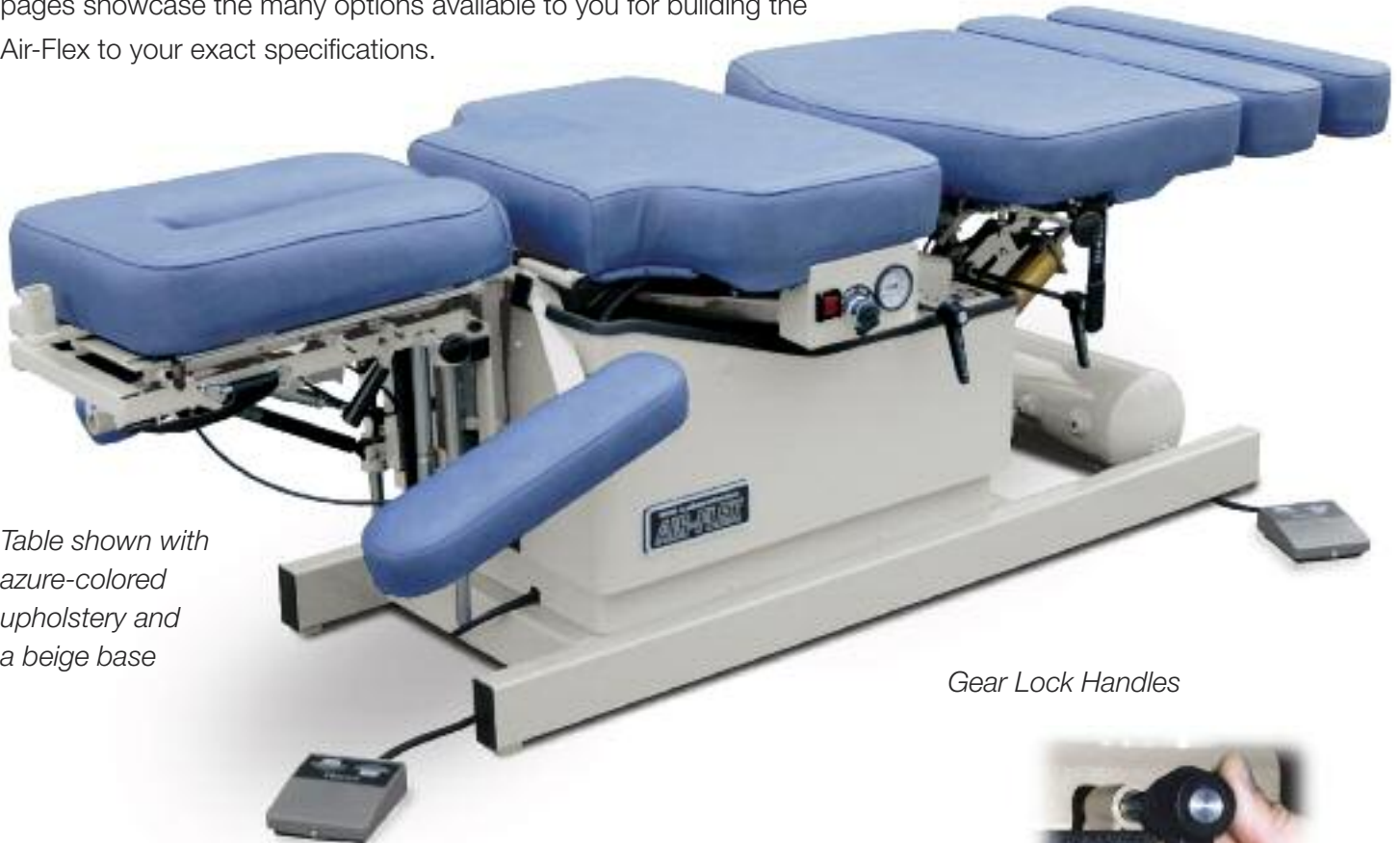
Table shown with azure-colored upholstery and a beige base

The Air-Flex Table has revolutionized flexion-distraction. Once you've treated with an Air-Flex, we're confident you'll never be satisfied with an ordinary flexion table again! The Standard Air-Flex and its features are detailed below. The following pages showcase the many options available to you for building the Air-Flex to your exact specifications.