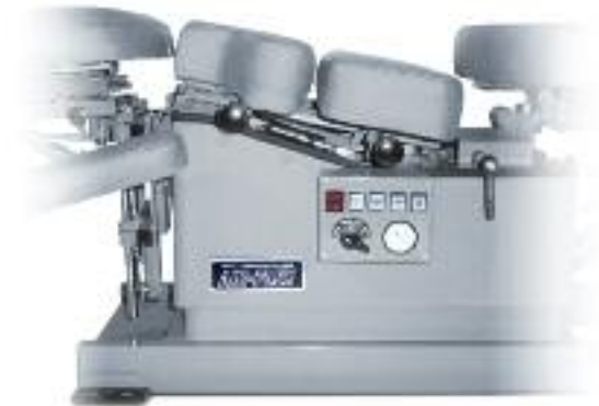
Raised Headpiece (shown tilted)