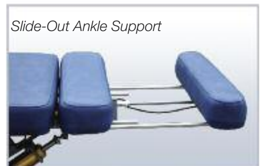
Slide-Out Ankle Support